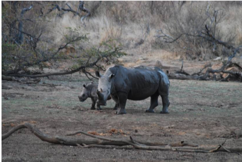
A great sighting of mum and calf by Galon Dam

It has been a busy month for rhino sightings however the majority are still running off on our approach and do not remain visible enough for a great sighting. Although one afternoon we were driving past Galon Dam and spied a female and her calf that had been wallowing in the mud and cooling off. We slowed down and crept towards the dam so we could get a good look at them and luckily they remained calm enough and stayed in sight. Another sub adult was also present but did not seem as relaxed as the mum and calf and ran off as soon as we approached.