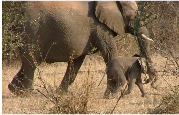
An exciting sighting of the secretive elephant herd with young calf

The beginning of September was a busy week for Elephant sightings. When on a drive up north near Telegraph Road we had a sighting of an unknown herd of 7 females slowly strolling through the bush. We were also lucky enough to see a herd at Mahoed Clearing of 3 females, 2 sub adults and a calf less than 6 months old. According to Izelle this is a very secretive group of elephants so made the sighting all the more special as we watched them drink and browse.