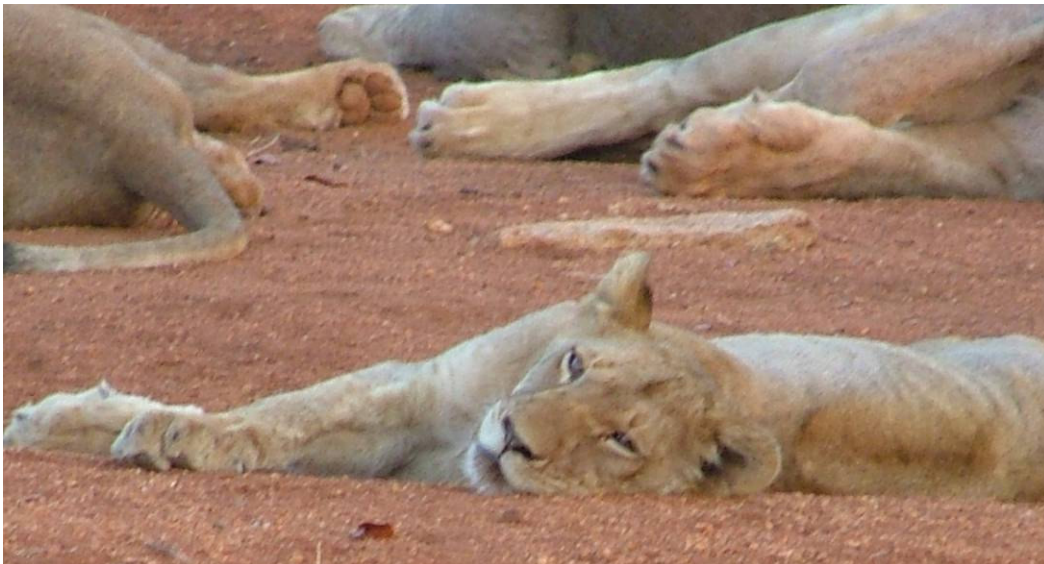
One of the cubs relaxing in the clearing

The cubs were in a playful mood and Stitches was trying to get in on the action. Amarula did not like this and slapped him away with a swift paw. After a while she relaxed and Stitches went on to play with the youngsters. The cubs took great delight in bringing down the rain gauge that sits in the middle of the clearing on a wooden stump, and continued swatting it around and chewing at it. One of Mica's cubs decided to hog the rain gauge and would not give it to Amarula's cub to play with, so Amarula promptly stepped in and urinated on the cub's head much to its shock!! The other two sub adults Skinny and Mburri were sitting alone slightly away from the pride, not showing Stitches' boldness in trying to get any closer to join in the fun.