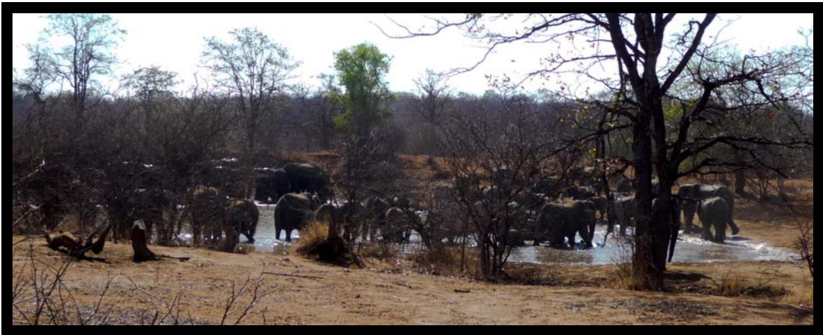
Mabottle Dam – Standing Room Only

The elephants have truly graced us with their presence this month with regular sightings of multiple herds occurring throughout the month. Many of these encounters have been by chance, even when unaided by our trusty radio telemetry we just kept running into them! Early in the month we had a close encounter with an elephant calmly eating in the middle of the road, luckily the elephant seemed to completely ignore us and continued to eat, clearly not going to move until it had finished its dinner. Then on the 13 th a magnificent sighting, an incredible 62 elephants were found playing and bathing at Mabottle dam, a sight leaving all volunteers and staff present in awe.