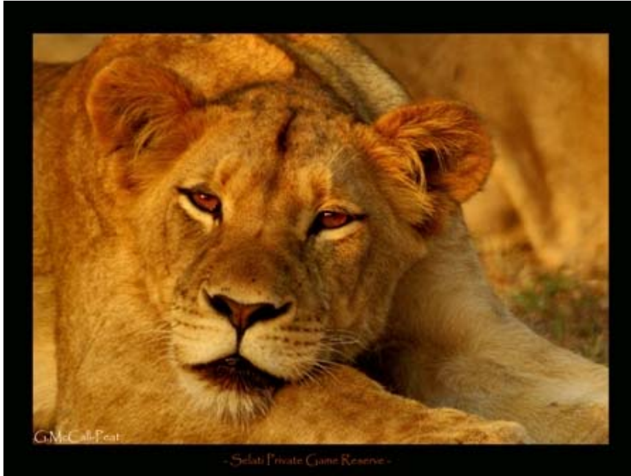
Mafadi resting up in the afternoon sun

The rest of the Selati pride have been making history and spent most of the month up in the far north of the reserve which is a first for them, but could just be an attempt to rid themselves of the boys. After spending about 2 weeks there they started making their way south again and have been seen a couple of times around the river.