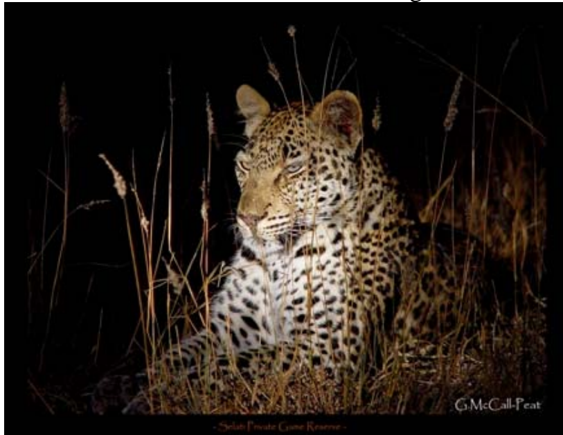
The sub adult leopard