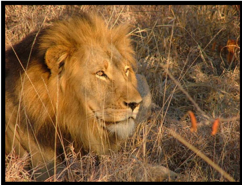
Shaka the King of the Beasts, on the lookout for Rooibos and Thamboti

Lion scats continue to be collected at every opportunity with analysis procedures being boosted by the arrival of new equipment. We have a number of samples of extracted hairs that have been cut into cross-sections and full scale gelatin imprints made. Results are imminent so watch this space..