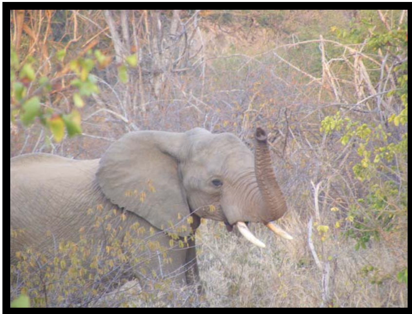
A young elephant giving us a sniff near Mahoed Clearing

The elephants have provided some great sightings this month with visuals of the breeding herds and adult bulls. One particularly memorable sighting had a breeding herd walking and feeding towards Mahoed clearing with four adult bulls following some one hundred meters behind.