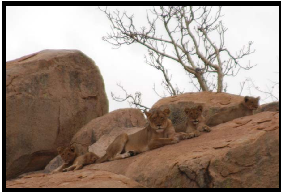
Selati and her three cubs on the lookout at Mahoed koppie

The frustrations of volunteers and staff alike ran high whilst the lions caused us to chase our tails all afternoon on 11 th July. But truth be told patient is always rewarded; just on nightfall we detoured to a dead end road behind Mahoed koppie not expecting to find much more than a strong monotone beep from the telemetry set and were astounded by the sight of a little tail in the grass. Yes you guessed it, lion cubs! Selati and her three cubs along with Shaka and Mopani were lying up near a dry dam close to Mahoed Koppie. Selati seemed unbothered by our presence and allowed the cubs to venture within feet of us. Needless to say cameras were flashing and adrenalin and excitement levels were rocketing off the scale! The cubs were seen on two separate occasions supposedly by themselves, however although Selati was not seen a strong signal from her collar indicated otherwise. After this encounter Selati and her cubs were seen on five separate occasions during July. Hopefully these fabulous sightings will continue for months to come.