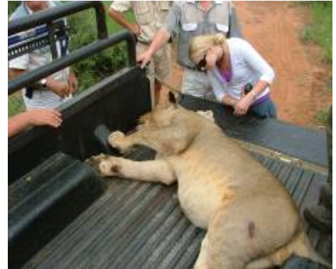
Right: Stitches out for the count, waiting on his collaring.

In response to the darting, the pride had retreated deep down south, as far down as the South perimeter fence. In the first few days following the darting, the L.E.O team struggled to get visuals of any lion. All we could do was to follow the telemetry direction, which pointed high into koppies which were inaccessible to us. The pride had found a perfectly secluded retreat.