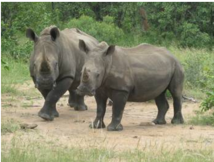
Left: rhino (55) and her daughter.

In ending, we are happy to report that all rhino that we have had the pleasure of viewing have been in good general health, and an average body conditioning of 4.