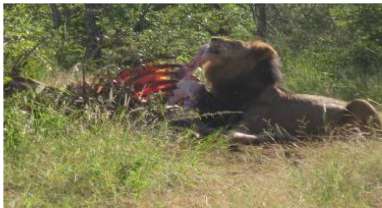
Right: Shaka on a fresh giraffe carcass.

Thankfully on the 14 th the pride, including Amarula and cubs, were found relaxing at a dam down south. Two days later, a hive of vulture activity led us to Shaka feeding on a fresh giraffe carcass; the others were also there, but were hiding in thick bush. It was an amazing sighting, thoroughly enjoyed by everyone.