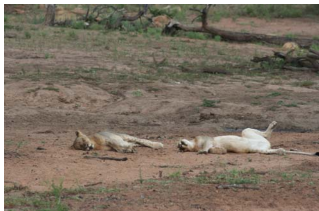
2 cubs enjoying the position as top predators (KJB)