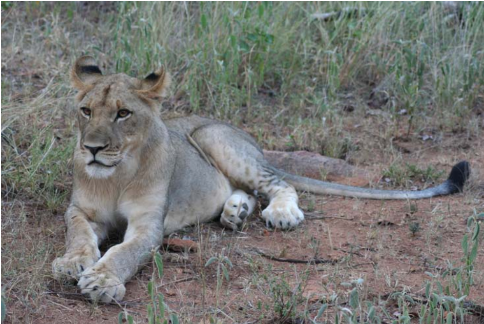
Male cub (KJB)