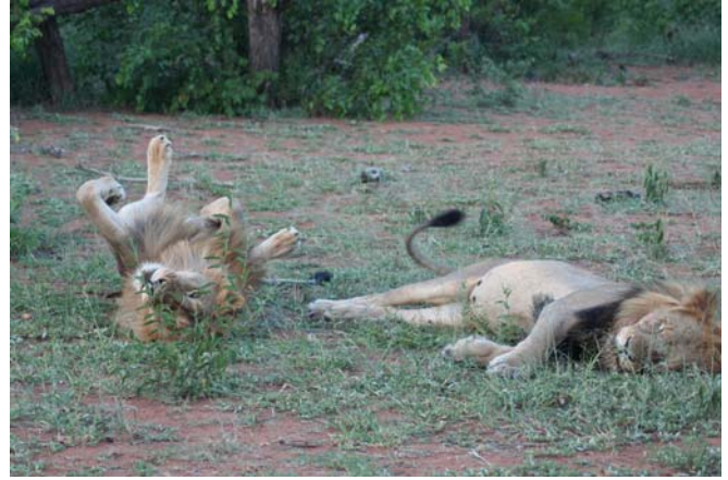
Mopani (left) & Shaka (right)